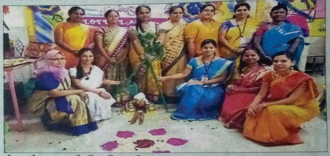
వేడుకల్లో పాల్గొన్న లోటస్ ల్యాబ్ స్కూల్ విద్యార్థులు