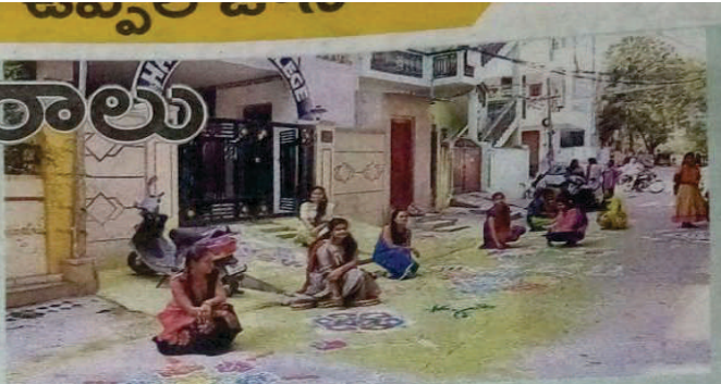
ముగ్గుల పోటీల్లో హైందవీ డిగ్రీ కళాశాల విద్యార్థులు