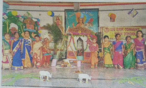
సాయిరాం స్కూల్లో జరిగిన సంక్రాంతి సంబురాల్లో విద్యార్థులు